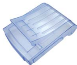
Spill proof cover